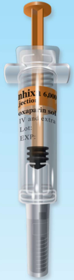
Illustration of Inhixa 6,000 IU (60mg) in 0.6mL